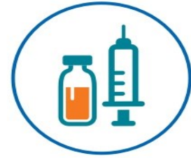
Get Recommended Vaccines

To learn more about antibiotic prescribing and use, visit www.cdc.gov/antibiotic-use